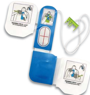
CPR-D-padz Trainer Electrodes Part# 8900-0804-01