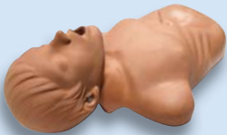
AED Plus Trainer Demo Manikin Part# 8000-0835-01