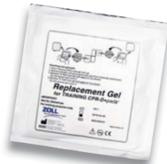
Replacement Adhesive Gels for CPR-D-padz Trainer Electrodes Part# 8900-0803-01

(Replacements must be ordered separately)