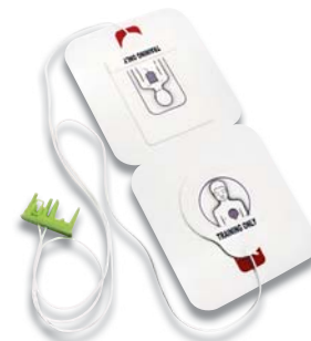
Pedi-padz® II Trainer Electrodes Part# 8900-000861-01 (case of 6)