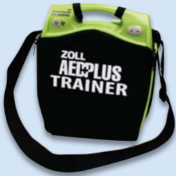
AED Plus Trainer Carry Case Part# 8000-0375-01