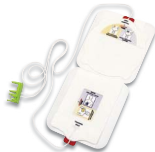
Stat-padz® II Trainer Electrodes Part# 8900-0805-01 (case of 6)