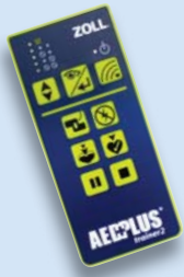
AED Plus Trainer2 Replacement Remote Part# 8008-0007